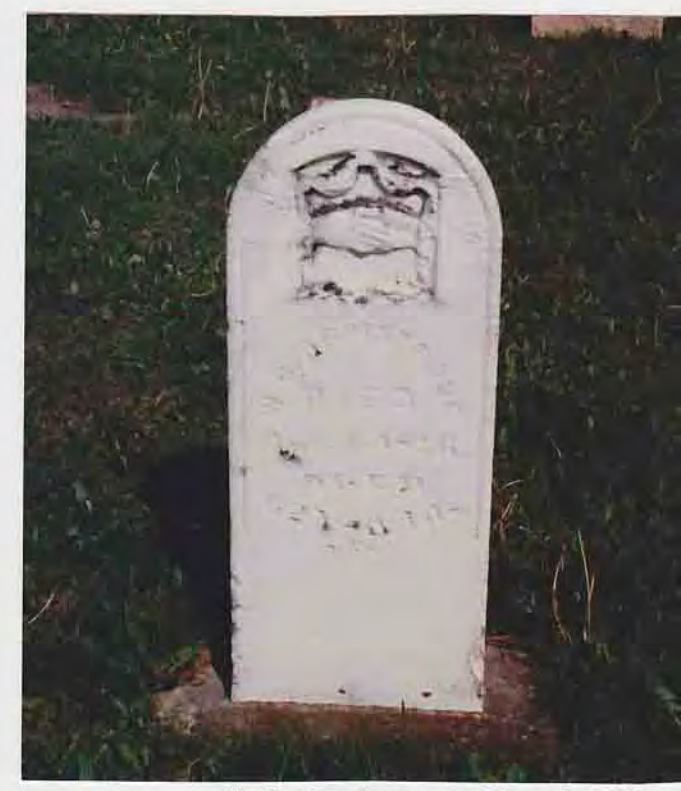
W. G. Armstrong, died Aug. 1, 1876 62 yrs. & 4 ds.