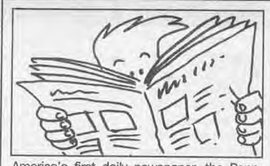
America's first daily newspaper, the Pennsylvania Evening Post and Daily Advertiser, was not published until 1783.